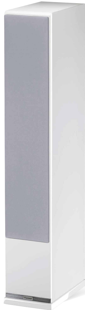
Piano white/white decor