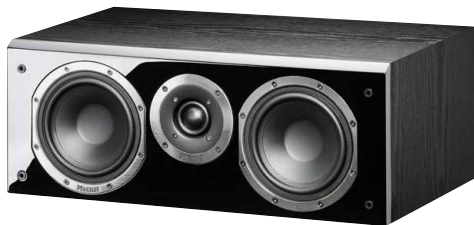
Shadow Center 213