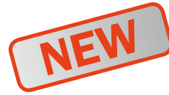
Shadow 102 ATM