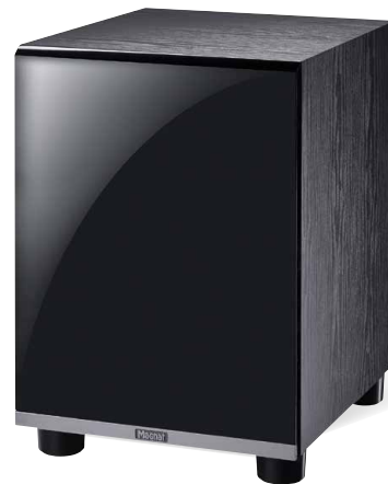
Shadow Sub 300A