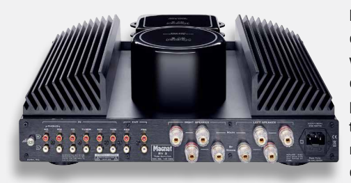
Winged: The curved heat sinks provide the RV 3 with a unique appearance. The connections leave nothing to be desired.

the encapsulated filter capacitors of the power supply unit. The circuitry inside the sturdy amplifier has been constructed very neatly. All functional units are clearly separated from each other - even the power supplies have been designed separately - thereby ensuring that they have little or no disruptive influence on each other. There have not been any cutbacks either with regard to the components used: